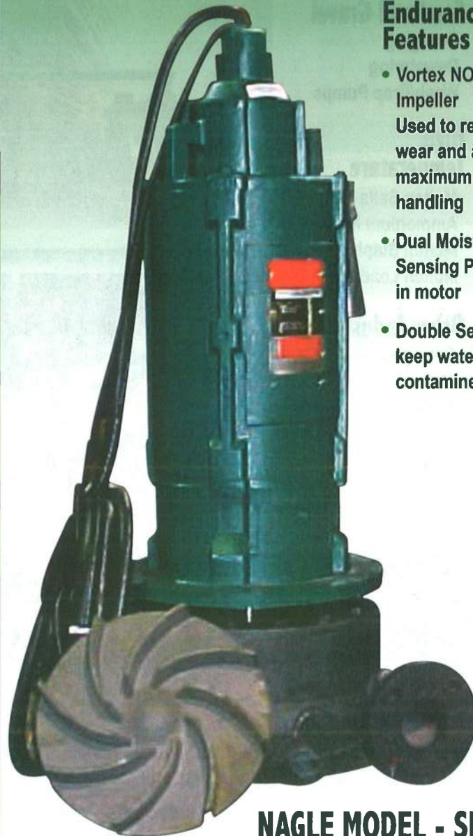
NAGLE MODEL - SMV

FOR ADDITIONAL INFORMATION ON OUR COMPLETE LINE OF FINEST QUALITY PUMPS CONTACT THE NAGLE REPRESENTATIVE IN YOUR AREA - OR CALL US DIRECT